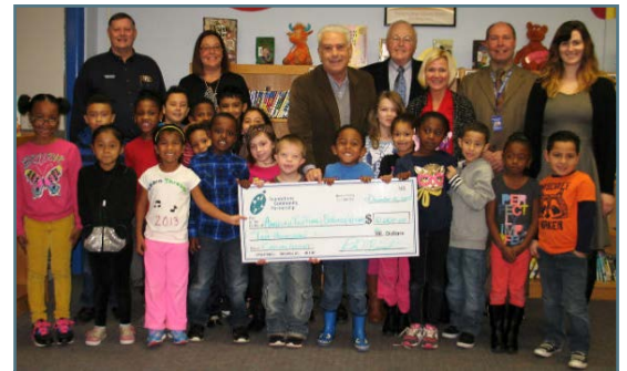
Faust Elementary, Bensalem