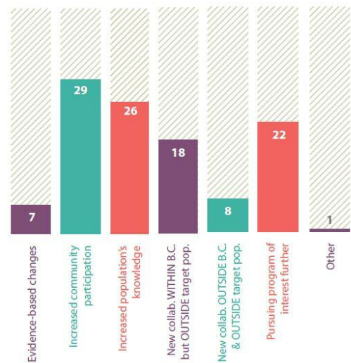
Figure 8: FCP's Primary Types of Impact on Organizations' Work 2007 - 2013, n = 47