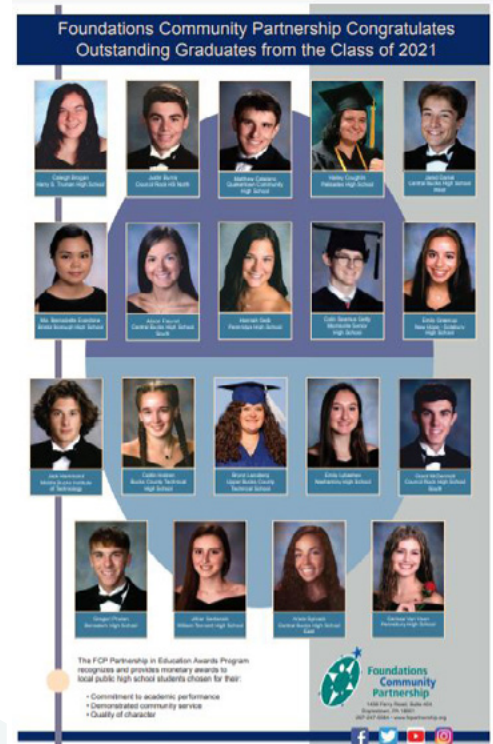
Click Image to view full-size poster